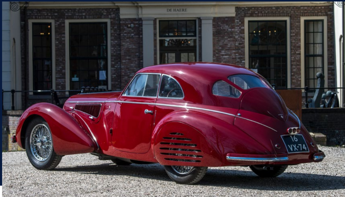
1939 ALFA ROMEO 8C 2900 TOURING BERLINETTA #412024 Estimate : 16 - 22 M€