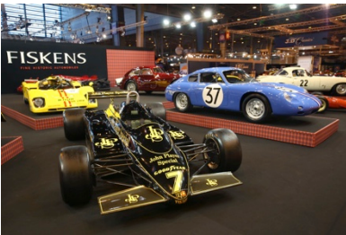
Major international dealers