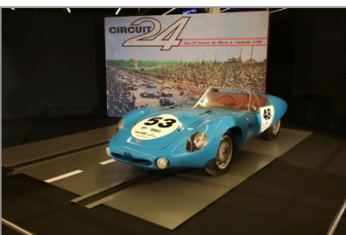
110 anniversary of the Automobile Club de l'Ouest