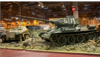
Saumur Tank Museum